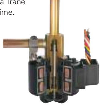
The Hyperion's electronic refrigerant flow valve has exceeded 1 million cycles in extensive lab testing, proving it to be as much as 400% more reliable than standard valves undergoing the same tests.