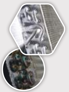
Traditional copper and galvanized steel coils are highly susceptible to corrosion.